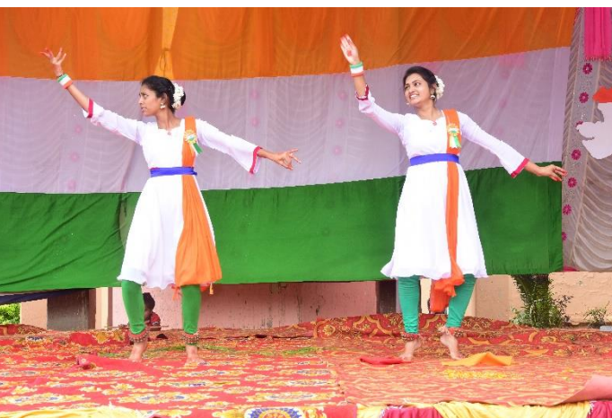
Cultural Dance Team