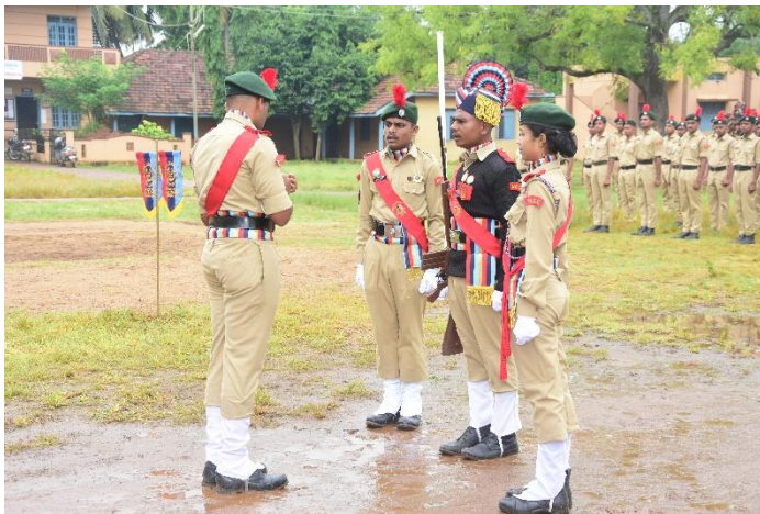
Reporting: JUO to SUO