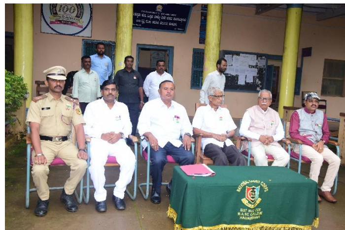
Chief Guest on the Dias