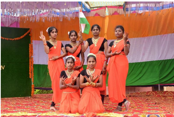
Cultural Dance Team