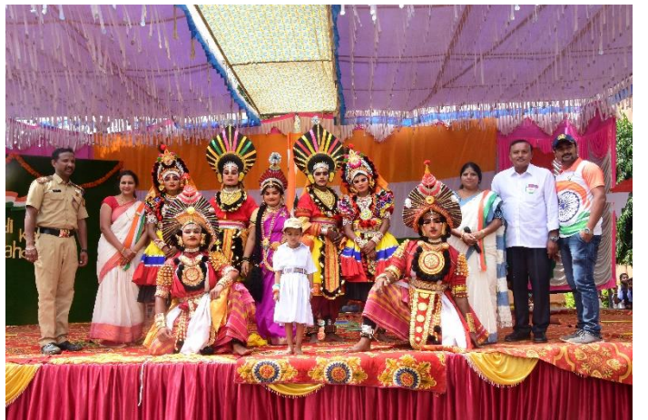
Cultural Dance Team