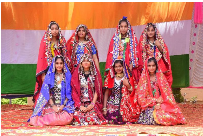
Cultural Dance Team