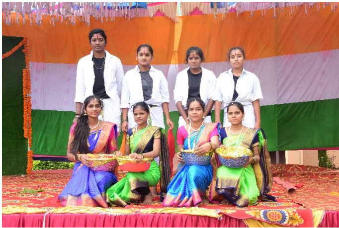
Cultural Dance Team