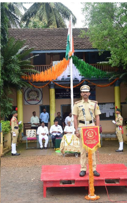
Welcome Speech by ANO