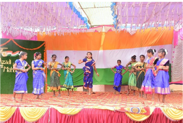
Cultural Dance Team