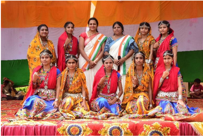
Cultural Dance Team