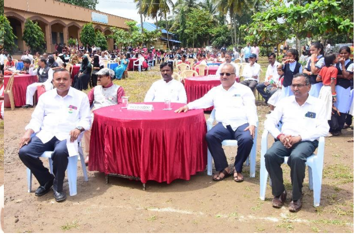
Head of the Institutions