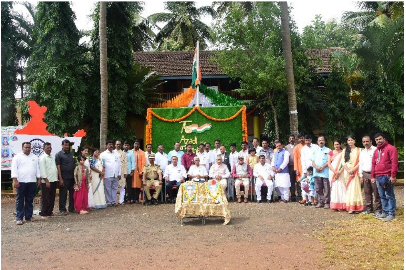
MASC College Staff