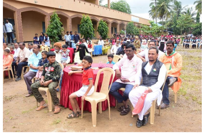
Staff and Students