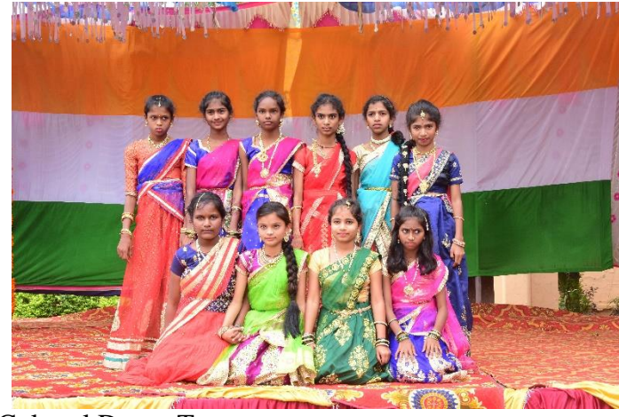
Cultural Dance Team