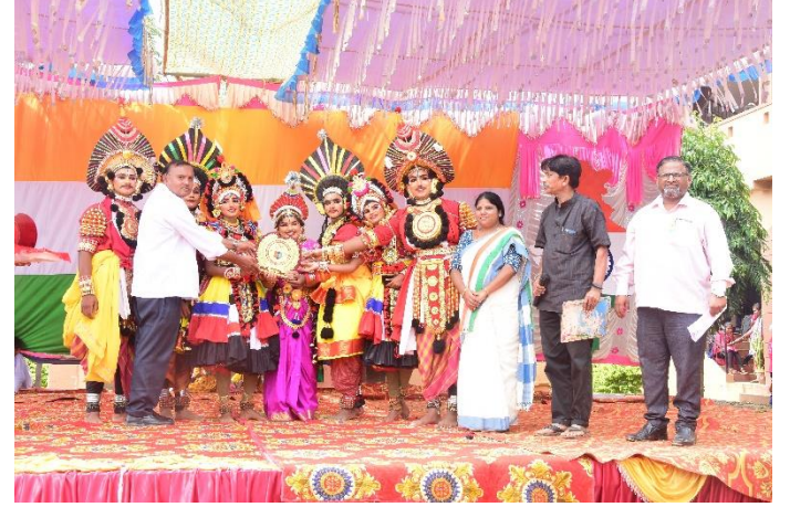
1 st Prize Team: Karnataka's Yakshagana by NCC Cadets