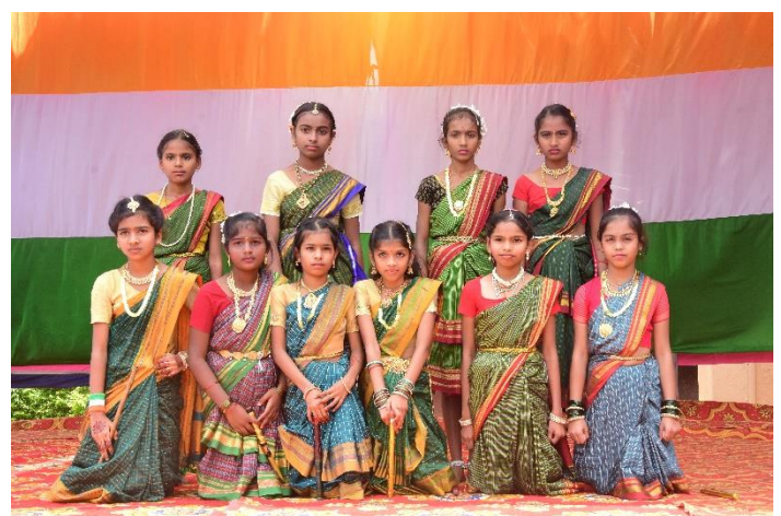
Cultural Dance Team