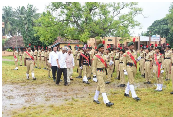
Parade Nireekshan by Chief Guest