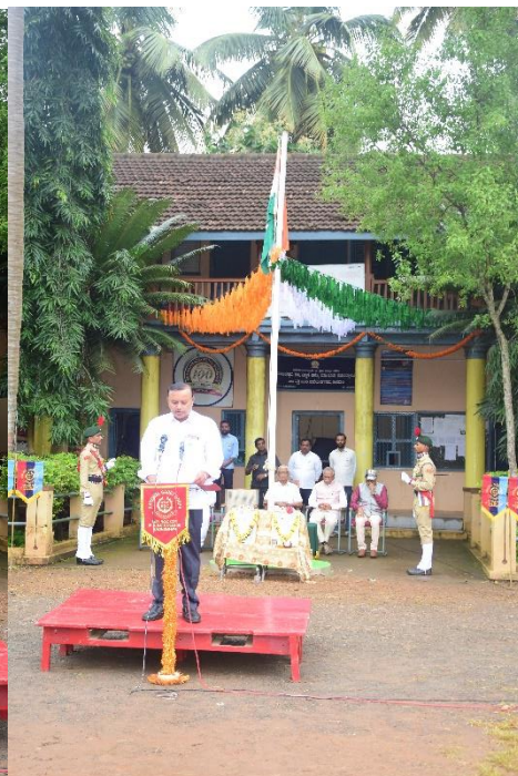
NCC Pledge by Principal