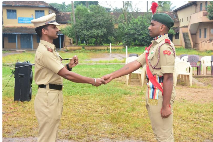
Reporting: SUO to ANO