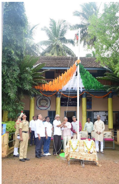
Flag Hoisted by Chief Guest