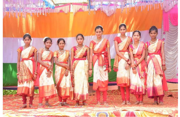
Cultural Dance Team