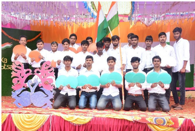
Cultural Dance Team (2 nd Prize)