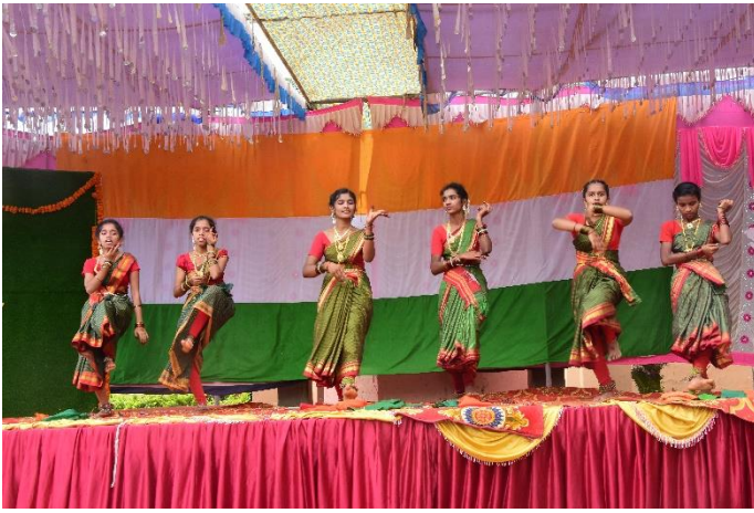
Cultural Dance Team