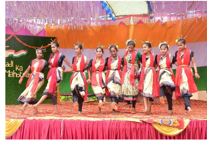
Cultural Dance Team