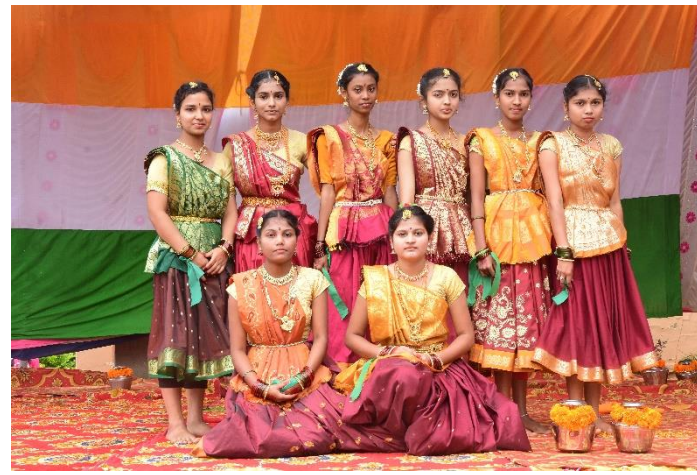
Cultural Dance Team