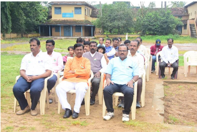
Our College Staff